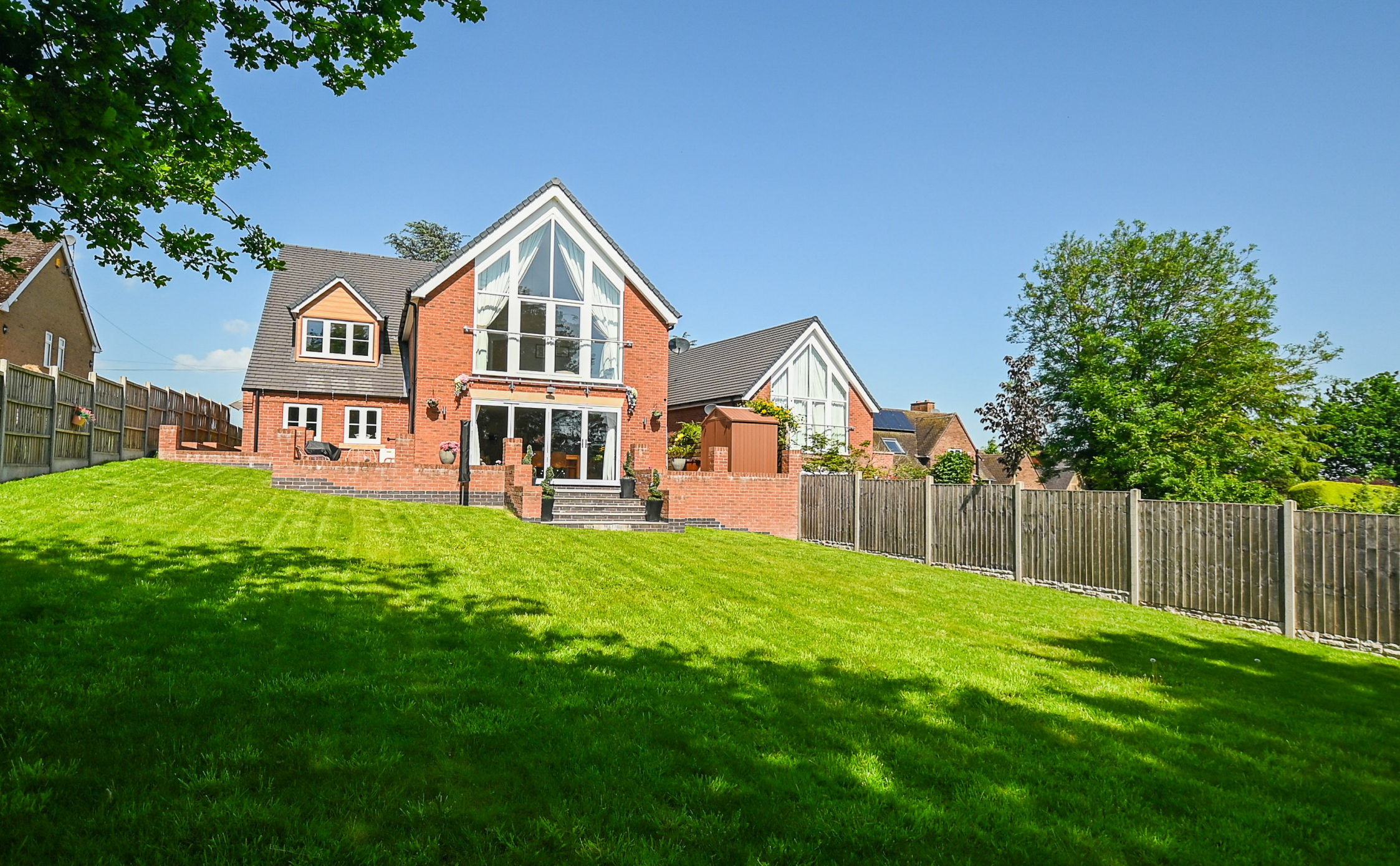
Cedar View, Draycott Cliff, Draycott in the Clay, DE6 5GZ